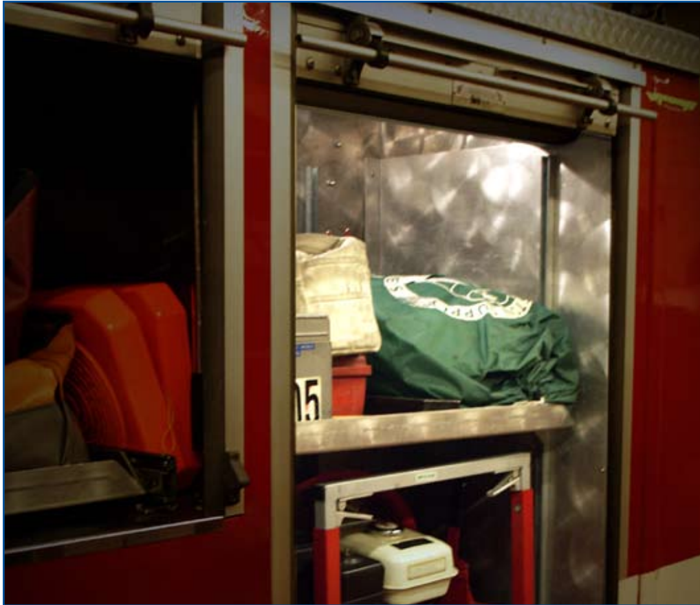
Perfect for interior trunk or compartment applications, or exterior applications like pump panels or ground lighting.